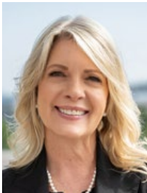
MAYOR Gabrielle Hanson GabrielleforMayor.com

“As Mayor of Franklin, I am dedicated to preserving the unique charm and appeal that our city offers. I believe in sustainable growth, ensuring the safety of our citizens, a sound fiscal budget, traditional values, putting families first, protecting our children, supporting small businesses and smart economic growth, and preserving the rural charm and unique character of our city.”