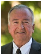
ALDERMAN-AT-LARGE A Clyde Barnhill franklinTN.gov

“As Mayor of Franklin, I am dedicated to preserving the unique charm and appeal that our city offers. I believe in sustainable growth, ensuring the safety of our citizens, a sound fiscal budget, traditional values, putting families first, protecting our children, supporting small businesses and smart economic growth, and preserving the rural charm and unique character of our city.”